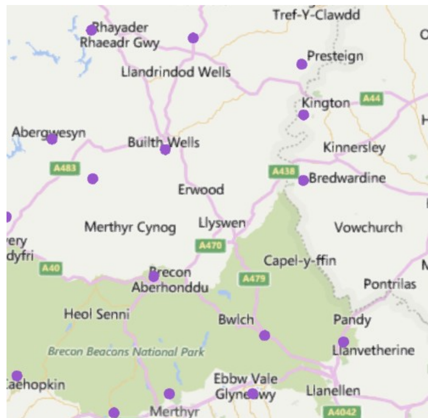
Map of Preventative Services for Adults and Older People

There is currently no Day Centre Provision in this Locality